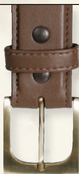
1.5" PLAIN BROWN