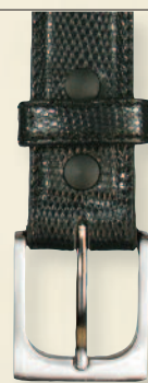
1.25" LIZARD FINISH