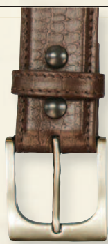
1.5" GATOR FINISH BROWN