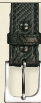
1.25" CARBON FIBER FINISH