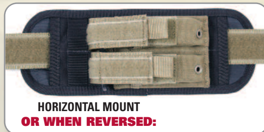
HORIZONTAL MOUNT OR WHEN REVERSED: