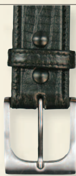
1.5" GATOR FINISH BLACK